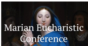
Marian Eucharistic Conference